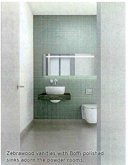
Zebrawood vanities with Boffi polished sinks adorn the powder rooms.