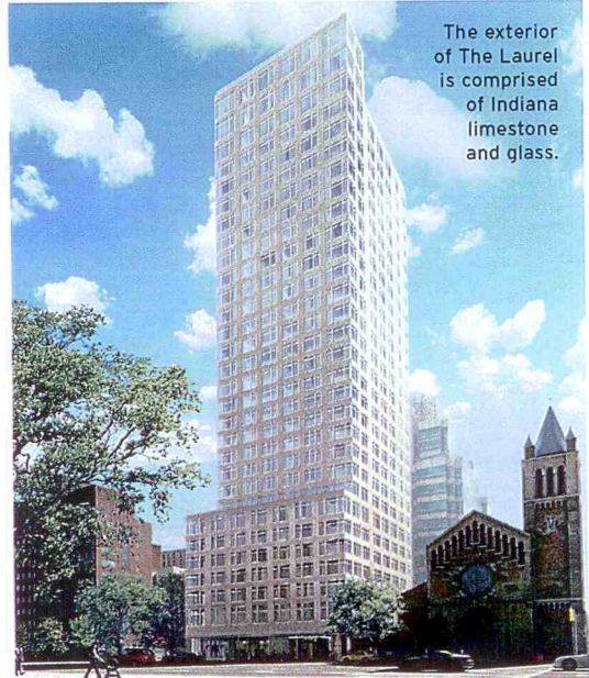
The exterior of The Laurel is comprised of Indiana limestone and glass.

With its Indiana limestone-clad exterior and expansive glass windows, The Laurel is an emblem of both high design and uptown sophistication. The 129 well-proportioned residences range in size from studios to six bedrooms, each with oversized windows to allow maximum light and ceiling heights ranging from nine to 12 feet. The units contain luxurious natural materials like solid white oak flooring and include amenities such as ultra-quiet, four-pipe fan coil systems with year-round climate control, Bosch large-capacity washers and dryers, and high-performance windows.