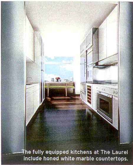
The fully equipped kitchens at The Laurel include honed white marble countertops.