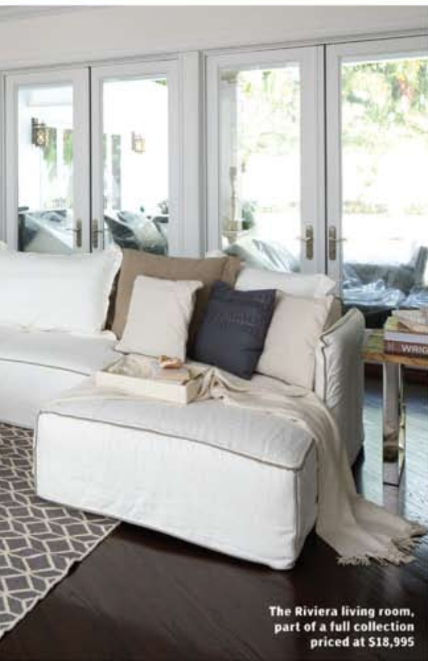
The Riviera living room, part of a full collection priced at $18,995