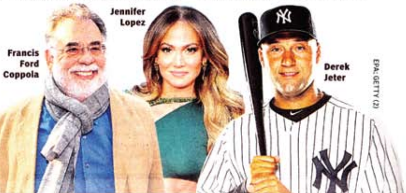
Francis Ford Coppola

Tui Lifestyle is already profitable. The company has no debt, no bank loans and manufactures all its own furnishings. They come out with new collections