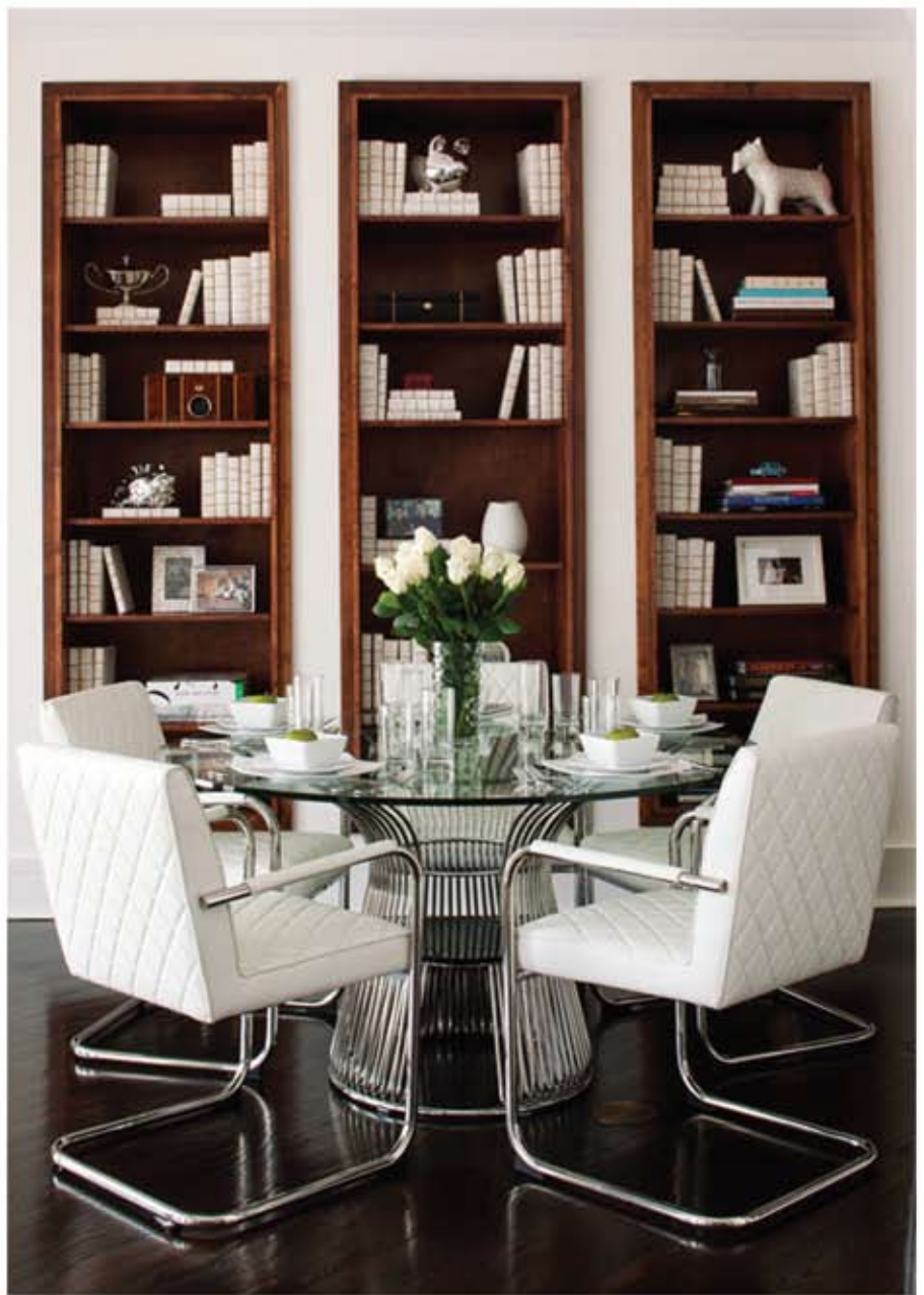
Above, Signature collection metal and leather dining set pairs well with wooden bookcases. Left, the exterior of the Greene St. showroom in SoHo, where most collections are on display